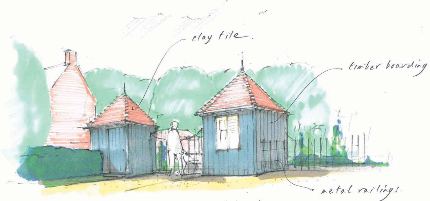
SV3 Sketch View of Allotment Pavilions

A proposed development by The Perbury Group