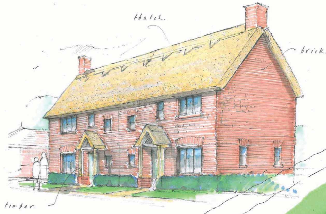
SV5 Sketch View of Thatched Cottages