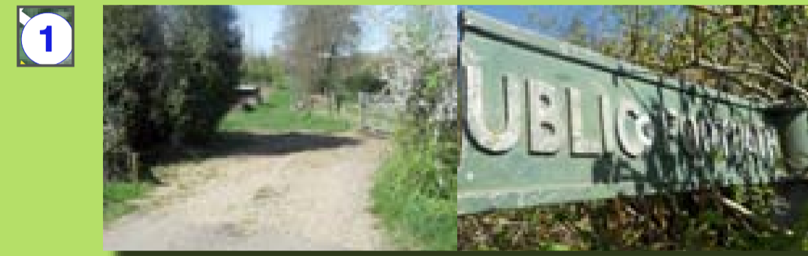
Footpath link from Knapp Lane to north

Pavements run both sides of the A3090 in the centre of the village.