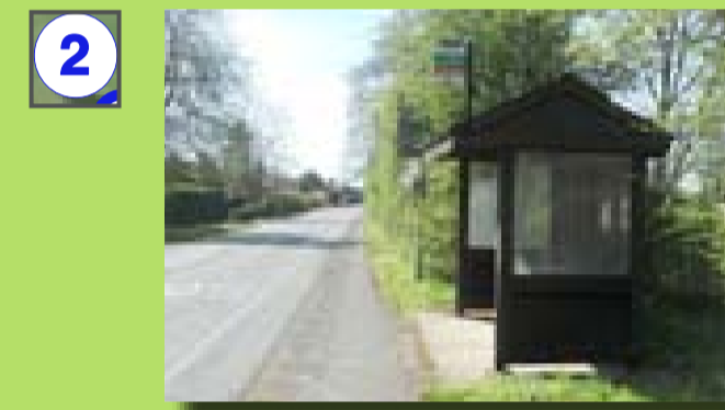
Bus stop on north side of A3090 (Morleys Lane)