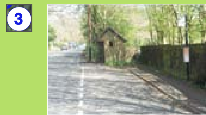
Bus stop on south side of A3090 (Green Pond Lane)